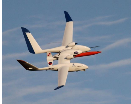
Figure 3: EOLE carrying an ARES rocket

Under the authority of the French DGAC, The EOLE carrier has performed several visual flights with and without the ARES rocket at the Saint Yan aerodrome in the centre of France. The last flight was performed in full automatic mode except the remote piloted take-off and landing. The next step is to perform the flight at 20 km from the runway and 4 km of altitude in order to be able to automatically release the rocket and ignite it safely.