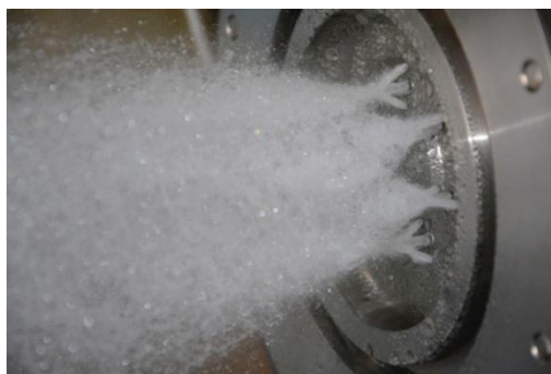
Figure 6: water test of the injecting plate.

Several water tests were performed at the Martel facilities in Poitiers. These rather simple tests enable to check the correct rate flow, the mixing plume shape and any leakage in the injection dome.