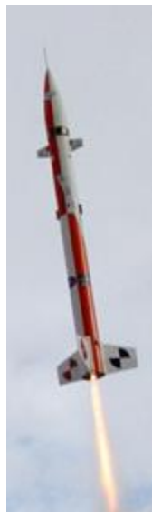
Figure 1: ARES launch at C'Space

Each year, some university associations are working beside pedagogic project in order to develop experimental rocket, named ARES [2]. Almost 20 rockets (diameter 160 mm, height 2.5 m and MTOW between 15 and 20 kg) were launched over the last 10 years, mainly during the French National campaign called C'Space organized by CNES.