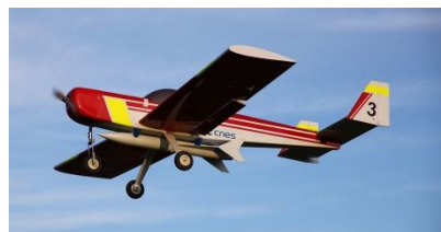
Figure 4: Mini remote piloted aircraft

Beside the EOLE large demonstrator, at a smaller scale a lot of experiments more open to students can be undertaken. This project is coordinated by Planète Sciences Partner. The purpose is to operate remote piloted airplane in order to test the release of a mini rocket in automatic mode. Despite the small scale (3 m wingspan) of these demonstrators the compliance with the regulation in force is imposed. The payload weight is 4 kg.