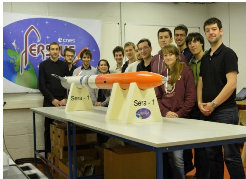
Figure 2: SERA integration before packing to Sweden

Based on this constant progression, our students worked on the SERA-1 rocket [1]. This project was coordinated by Bertin Technologies partner. A payload developed by students from Luleå Technology University from Sweden was embedded. It was launched in May the 7th 2014 in Kiruna from the polar base of the Swedish Space Corporation (SSC). The altitude reached is 5 km with a maximum supersonic Mach number of 1.3.