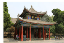
the Forest of Stele