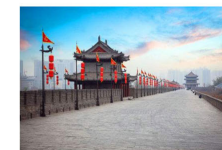
the Wall of Xi'an