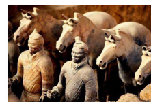
the Terra Cotta Warriors