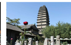
the Small wild goose pagoda