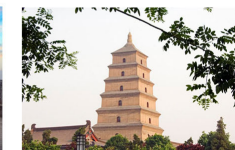
the Wild Goose Pagoda