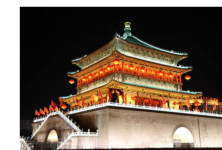
the Bell Tower