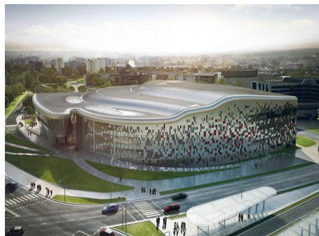
ICE KRAKOW CONGRESS CENTRE

Make the difference for your Company... Be a part of EUCASS 2015