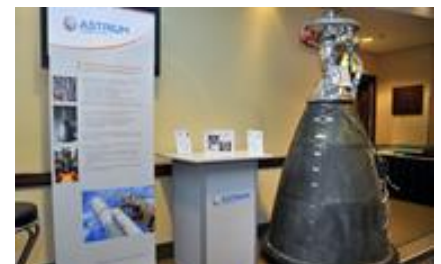
Pictures are not contractual